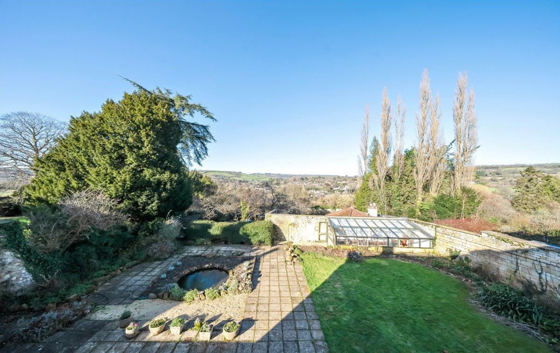
EAGLE LODGE, CHURCH STREET, BATHFORD, BA1 7RS £3,250 per month*