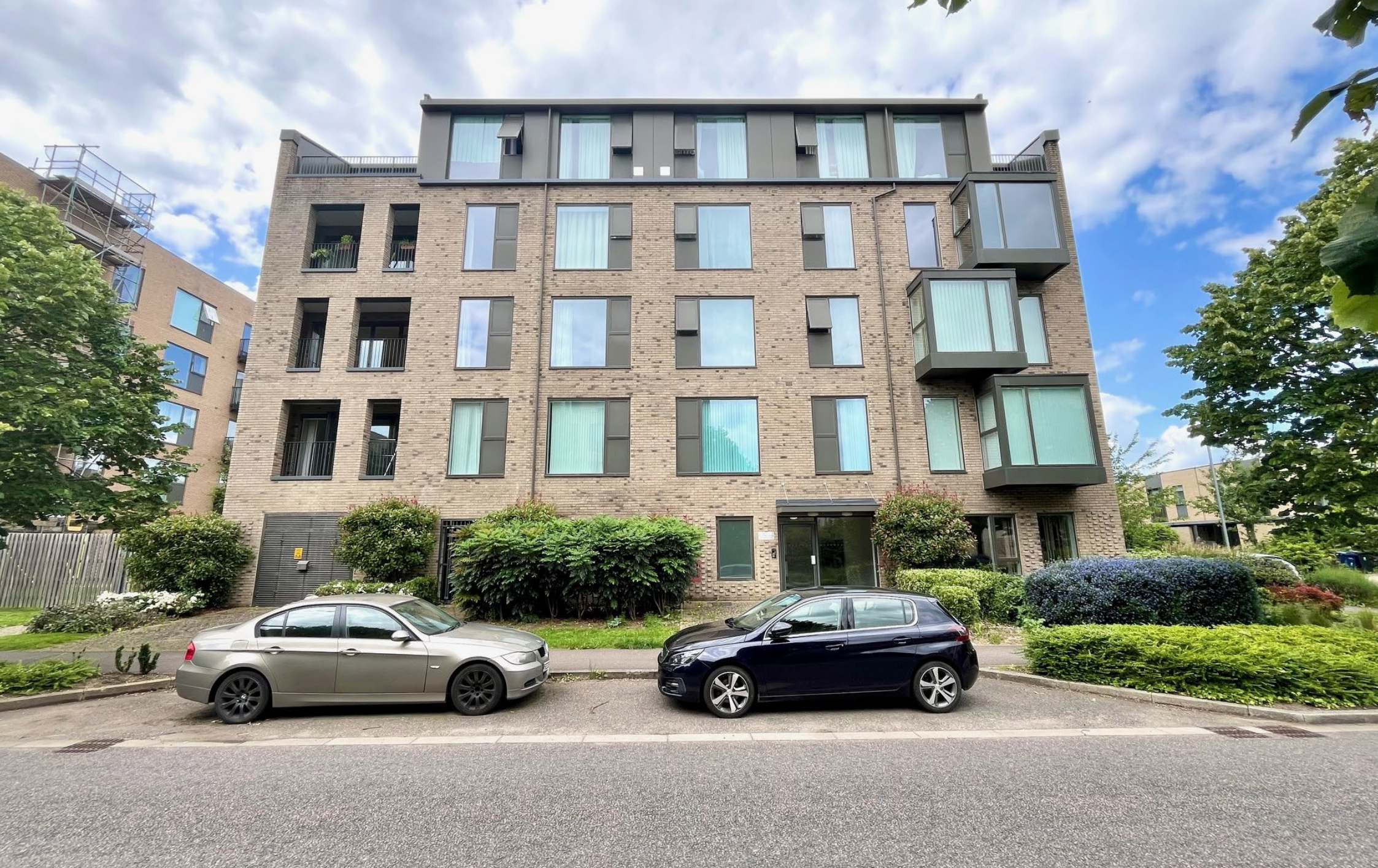
THE CALDWELL BUILDING Lime Avenue, Trumpington