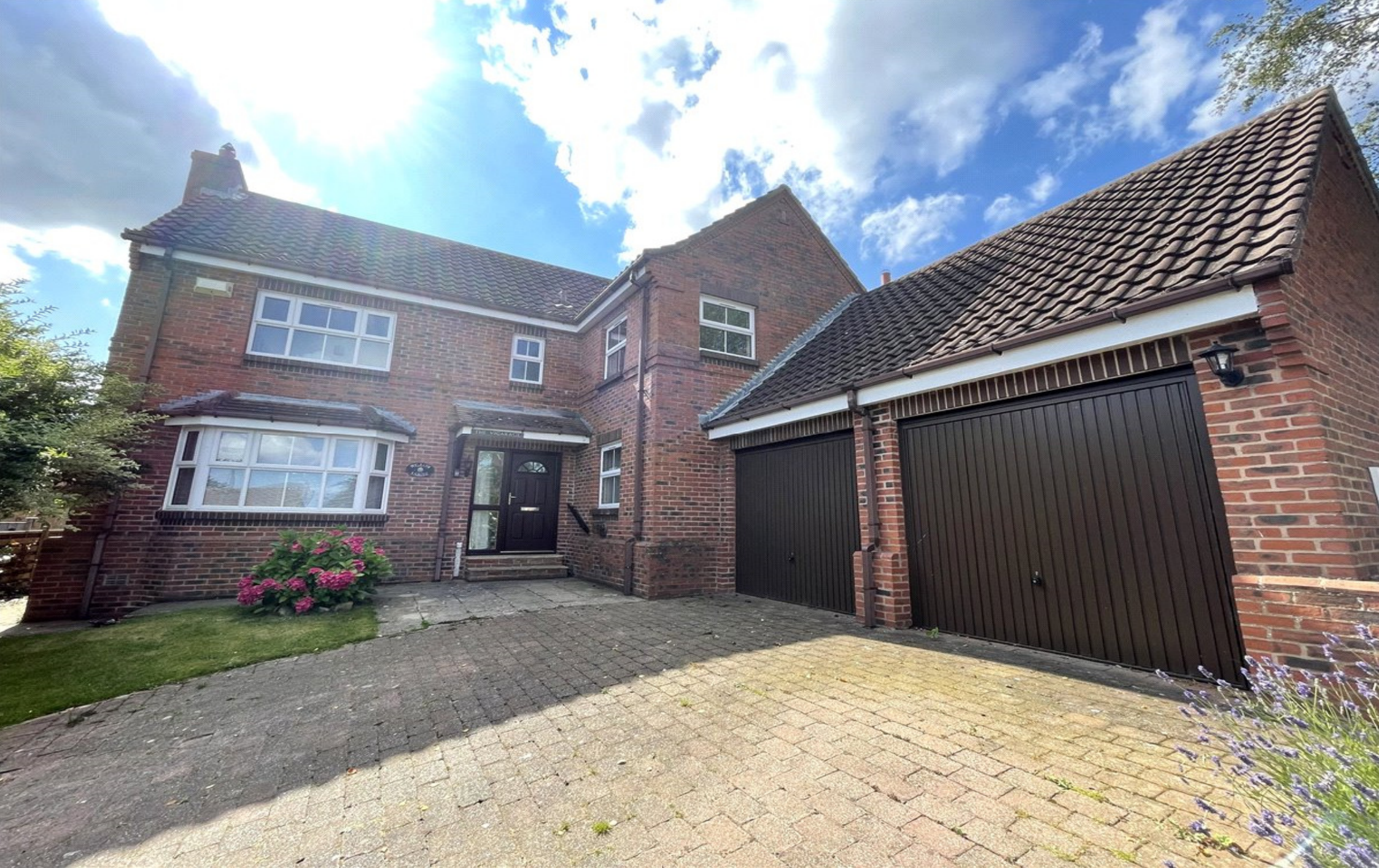
THE VICARAGE, 13 THE CROFT, KIRBY HILL, BOROUGHBRIDGE, YORK, YO51 9YA £1,600 per month