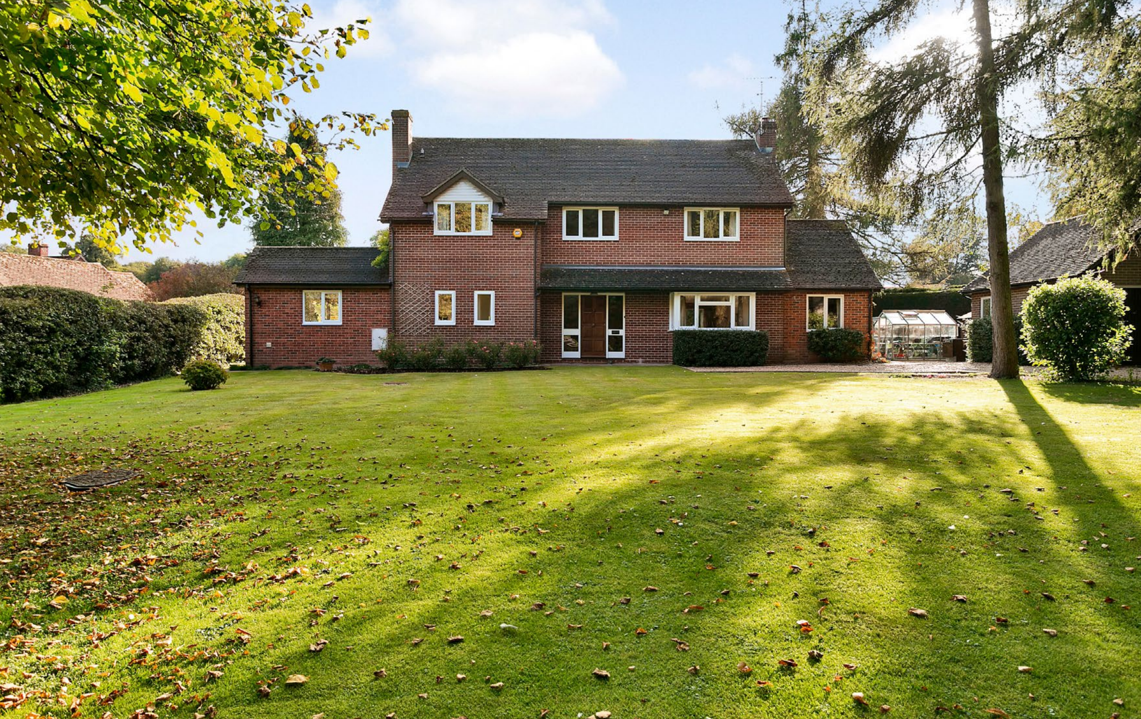
HAWTHORN HOUSE Guide Price £850,000