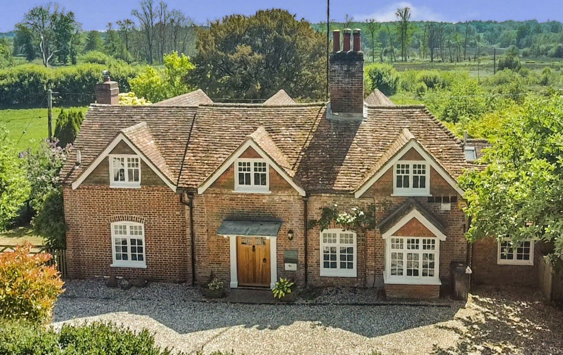
VALENCE COTTAGE Guide Price £1,250,000