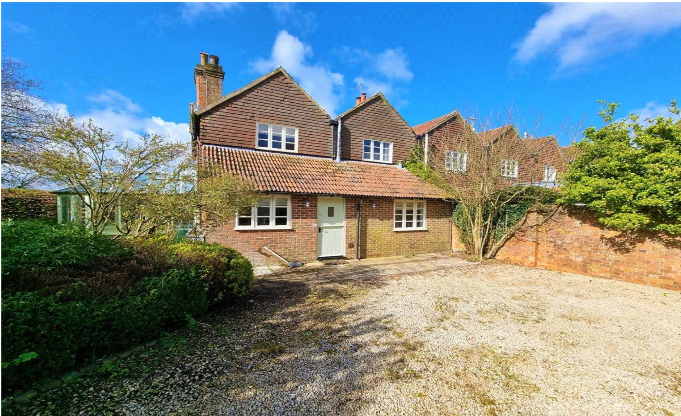
HARDING FARM COTTAGES, GREAT BEDWYN, SN8 £2,500 per month*