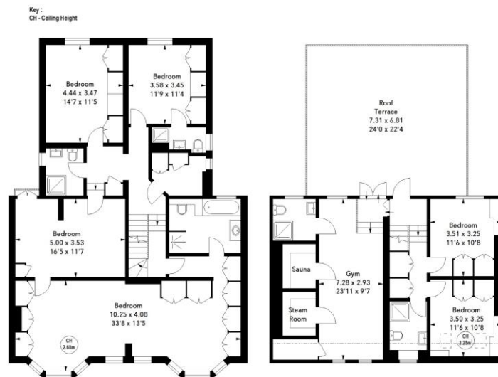
First Floor Approx. 126.62 sq m / 1363 sq ft Second Floor Approx. 74.51 sq m / 802 sq ft

The floor plan is not to scale and measurements and areas shown are approximate and therefore should be used for illustrative purposes only. The plan has been prepared in accordance with the RICS code of Measuring Practice and whilst we have confidence in the information produced, it must not be relied on. If there is any aspect of particular importance, you should carry out or commission your own inspection of the property.