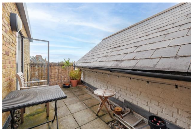
Classification E2 - Business Data