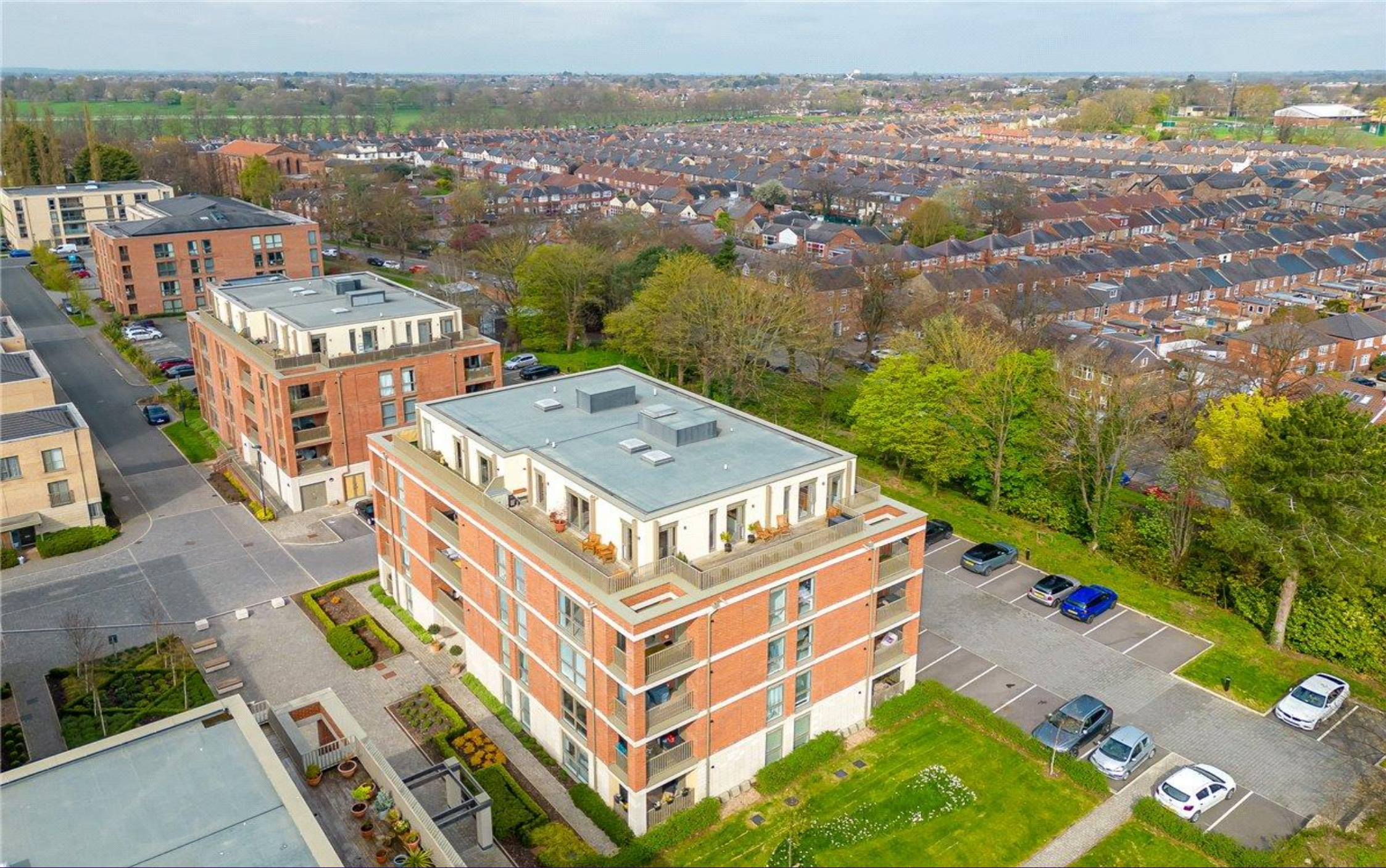
43 CAROUSEL HOUSE JOSEPH TERRY GROVE, YORK £650,000