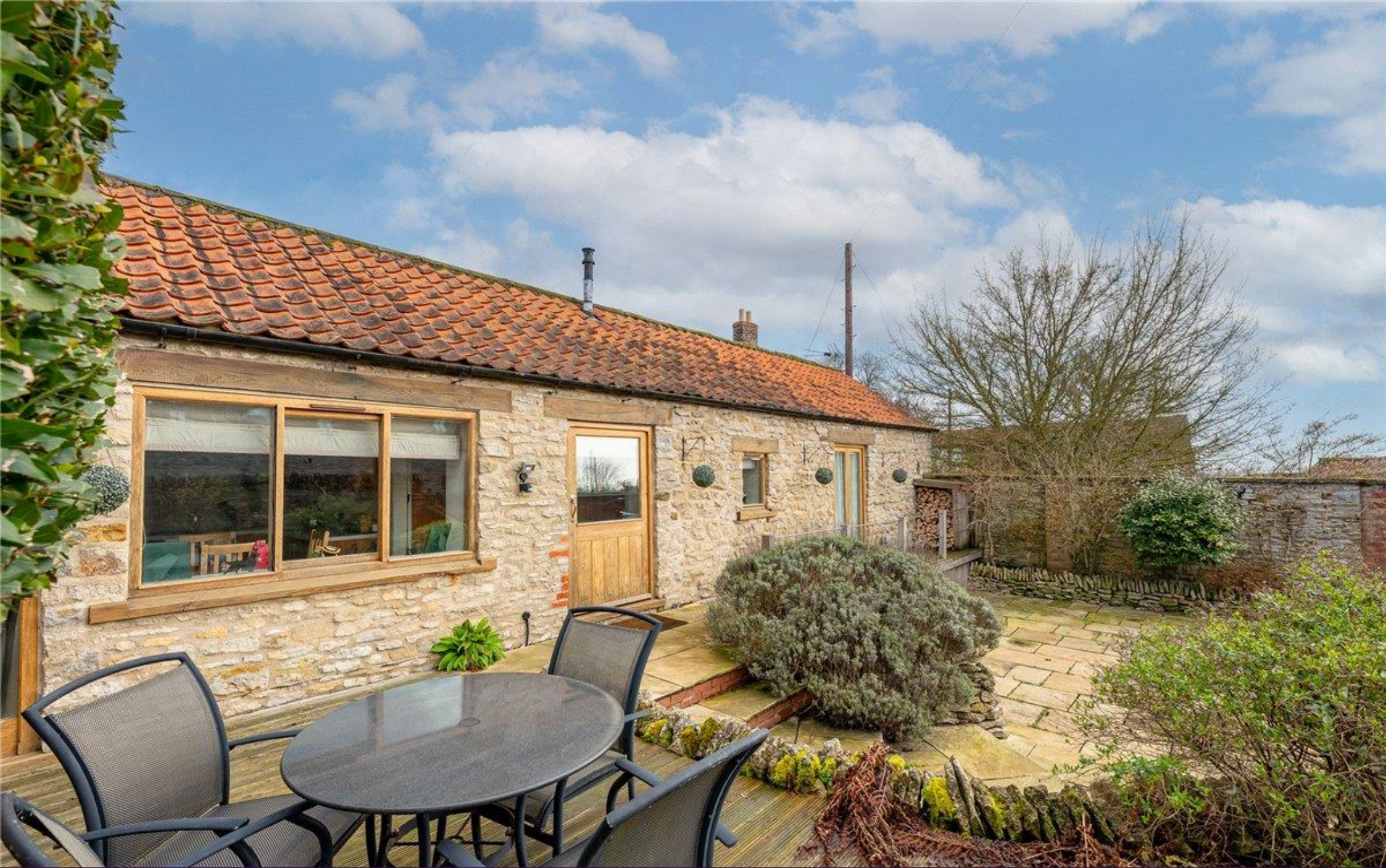
NORTH BARN, POCKLEY, YORK GUIDE PRICE £350,000