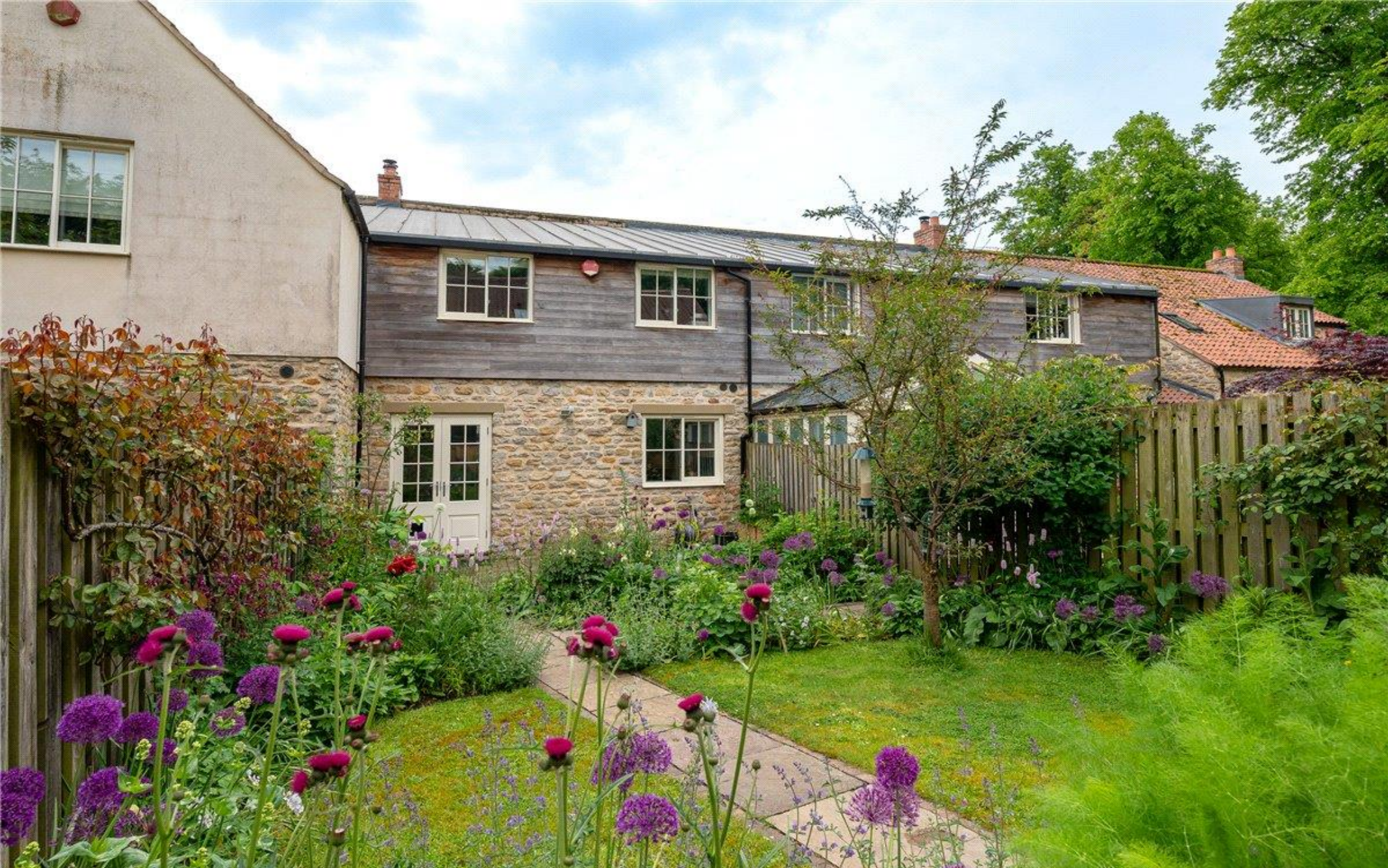
KIRKDALE MANOR, HIGHFIELD LANE, NAWTON £375,000