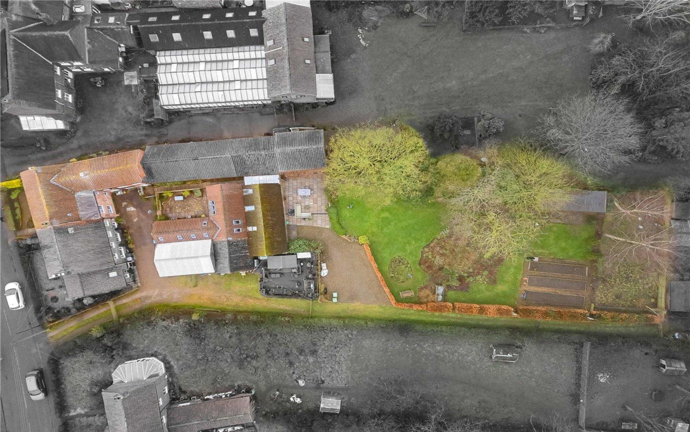
FORGE COTTAGE, MAIN STREET, LINTON ON OUSE £790,000