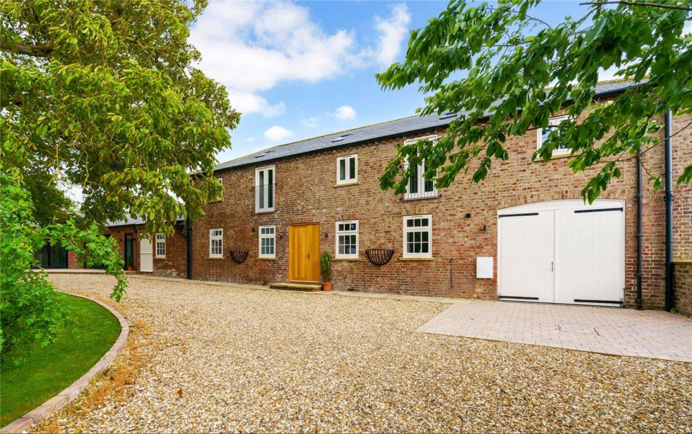
THE STABLES, NORTH DALTON, YO25 9XA £975,000