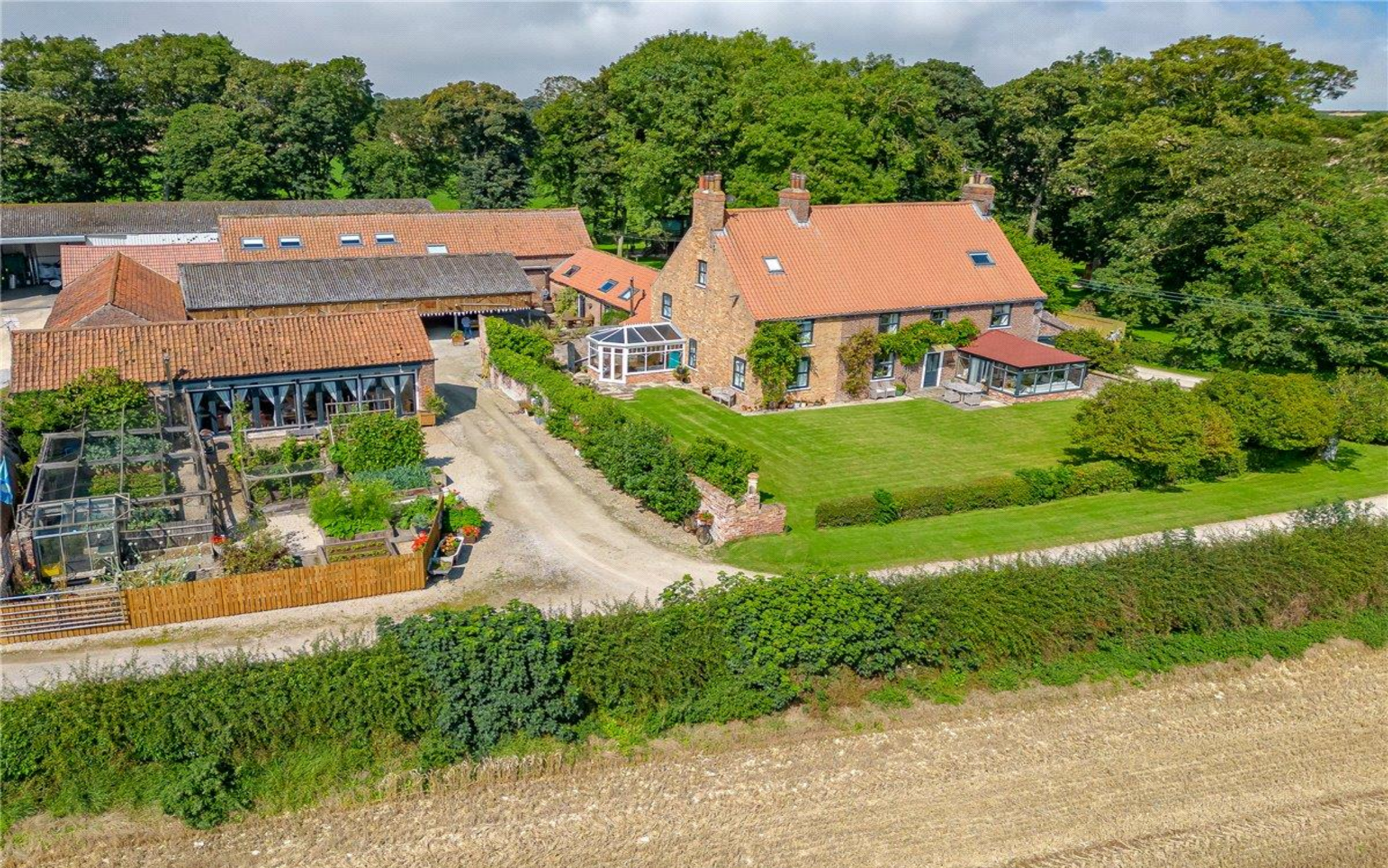
DALE FARM, HUNMANBY, FILEY £1,250,000